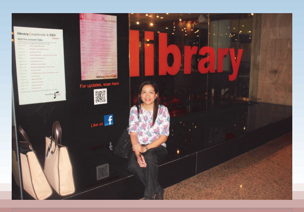
library @ esplanade