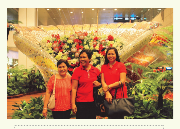
Garden at Changi Airport

I was one of the 3,000 delegates from across the world who is a new comer of the International Federation of Library Associations (IFLA) Conference in Singapore at Suntec City on August 17-23, 2013. The conference was a break from routine, an opportunity to meet different people and learn from other librarians' experiences. The opportunity to share school library programs and services brought joy knowing the similarities of experiences shared in our chosen profession. Regardless of the library type or size, whether in a developing or developed country, all embrace similar professional values. Every librarian wants to provide access to the vast information resources to multiple users as much as possible. These commonalities are the connectors that bind us together: this is the message the conference delivered to librarians as they help and guide their users to better and more prosperous lives.