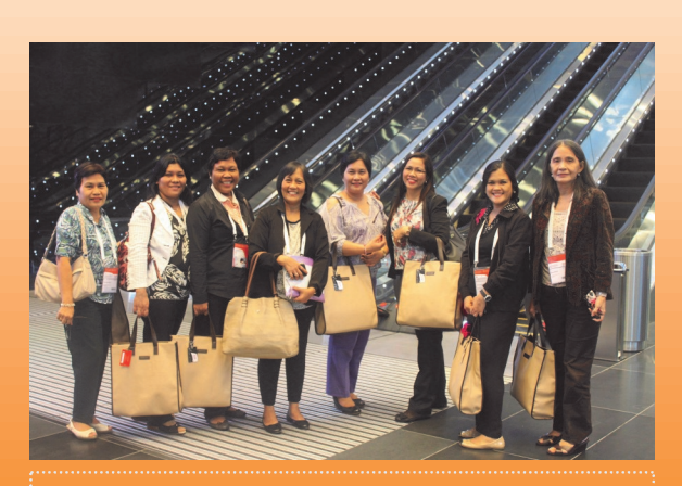
At the lobby of Suntec City