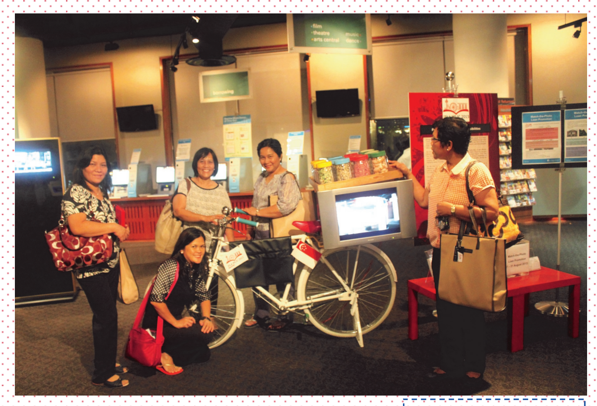
library @ esplanade