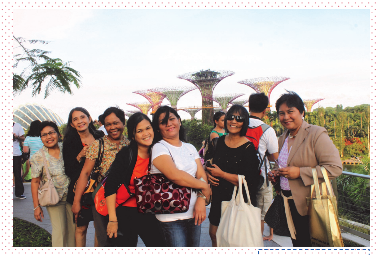
Gardens by the Bay