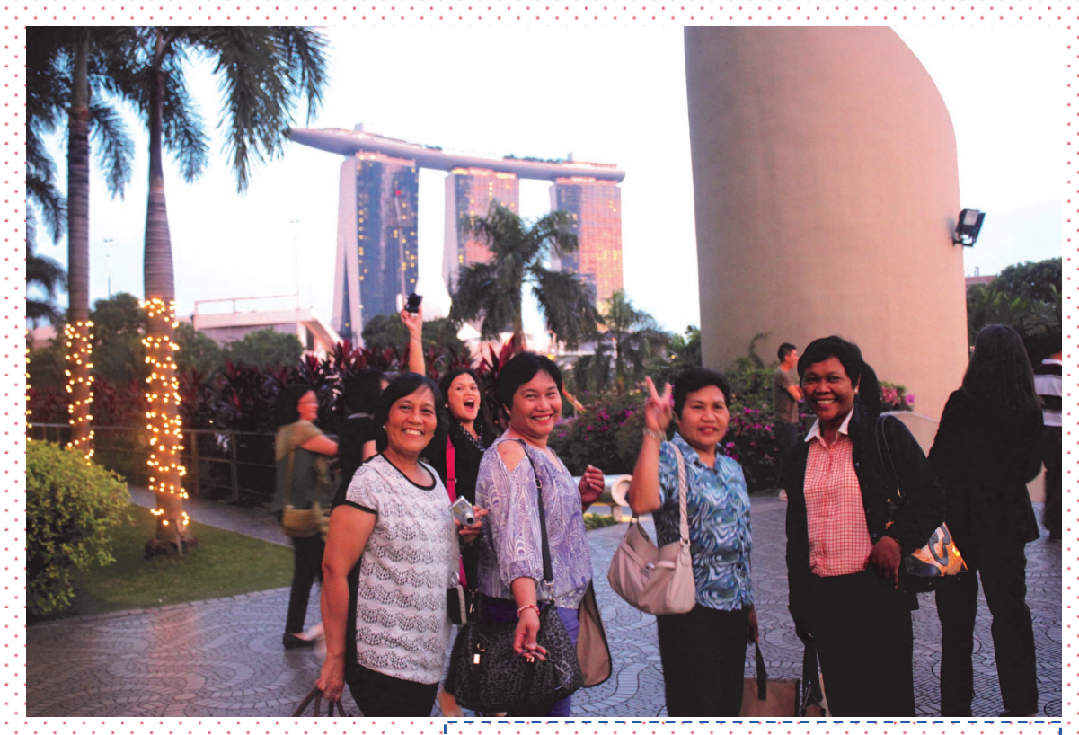
At the background is Marina Bay Sands