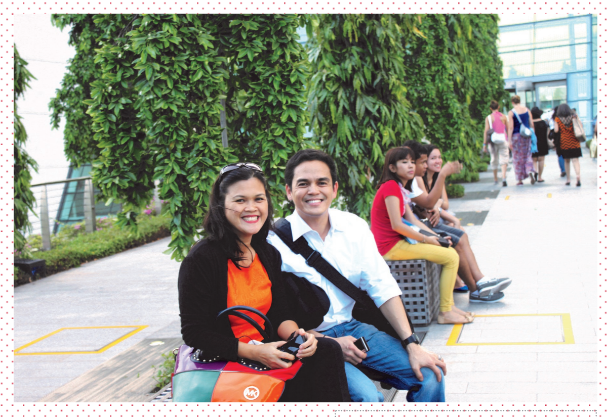
Marina Bay Sands