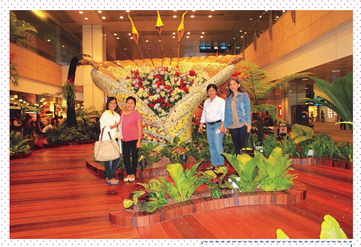
Changi International Airport